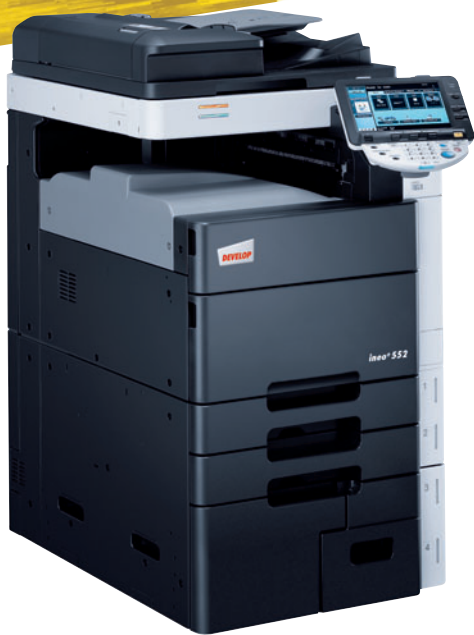
ineo+ 552 with output tray (OT-503)