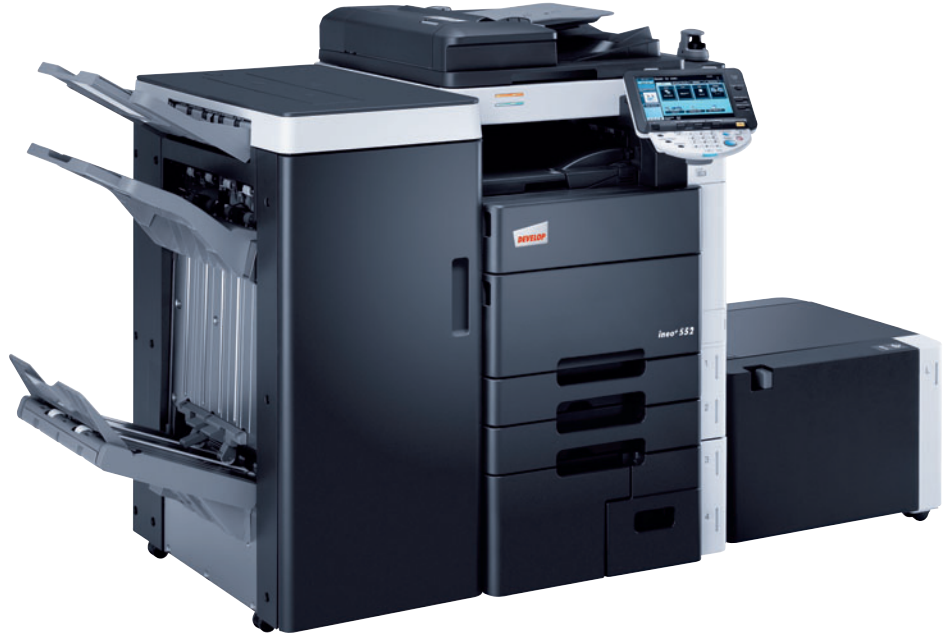
ineo+ 552 with staple finisher (FS-526), saddle kit (SD-508), working table (WT-506), biometric authentication (AU-102) and large capacity tray (LU-204)